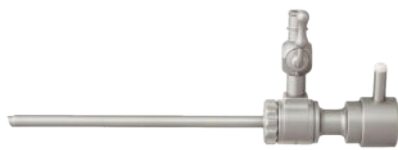
2250-510-332 ArthFlow® Arthroscopy Sheath, 1 stopcock, Ø 3.2mm