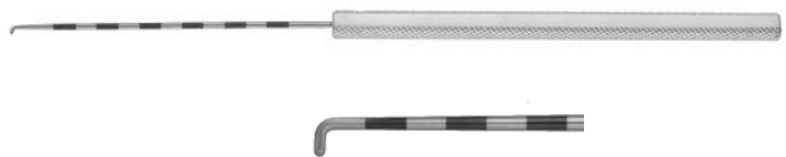
2250-100-123 Probe Hook Ø2,3mm, 1mm hook, graduated