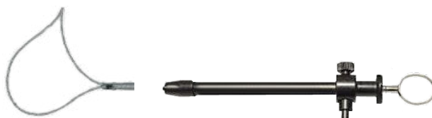
VED-220160-32 Polypectomy snare, flexible, Ø 1,6 mm, length 32 cm